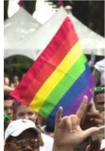
Houston Pride Parade, June 24, 2017.

article: https://www.click2houston.com/community/heres-what-you-need-to-know-about-houstons-2018-pride-parade