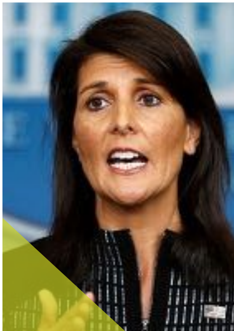
US Ambassador to the United Nations Nikki Haley speaks during a news briefing at the White House, September 15, 2017.